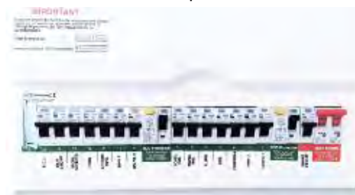
Utility Cupboard Consumer Unit

If you require the electrical supply to be shut off to specific areas of your home only, flip the relevant switch on the consumer unit to the “OFF” position. To restore power to the house/circuit flip the switch(es) on the consumer unit back to the “ON” position.