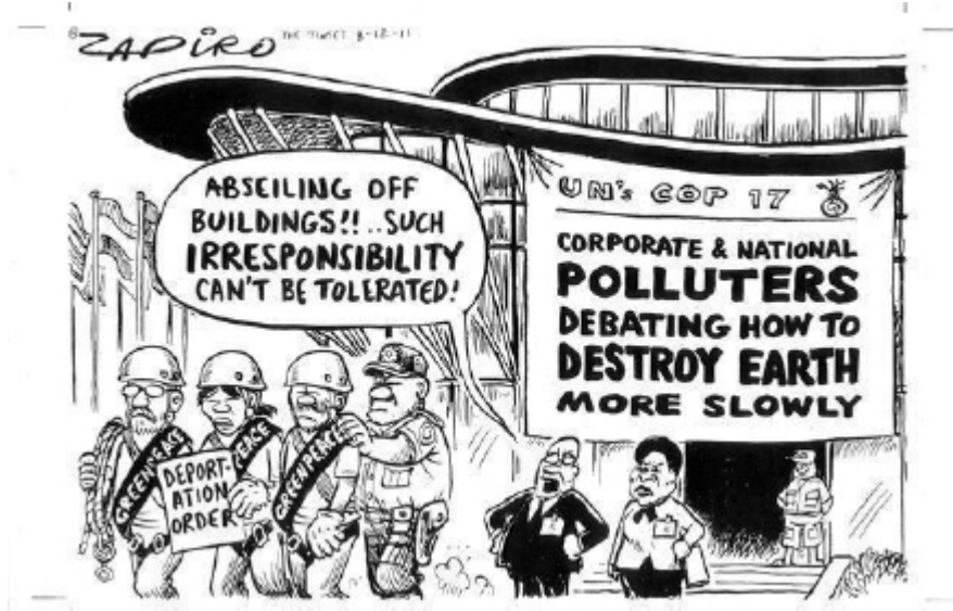
Figure 5. Debating how to destroy earth more slowly.