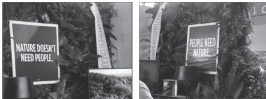
Figure 2. CI signs at the World Parks Congress, Sydney, November 2014.

International's 'Nature Is Speaking' campaign epitomizes this problematic ambivalence (see figure 2 ). This campaign features a series of short films in which high-profile celebrities like Harrison Ford and Julia Roberts assume the voices of natural forces (such as water and Mother Nature) and decry humans' rampant assault upon them. One of these short films, narrated by Robert Redford as a redwood tree, insists that the solution to this destruction is for humans to recognize that they are 'part of nature, rather than just using nature'. 21 Yet the campaign's own motto ('Nature Doesn't Need People, People Need Nature') emphasizes this same separation between people and nature that is seen as the problem, a separation further reinforced by many of these short films in which narrators explicitly speak, as elements of nature, to their distinction from a generic humanity. Julia Roberts, as Mother Earth, for instance, proclaims, 'I am nature. I am prepared to evolve. Are you?' 22