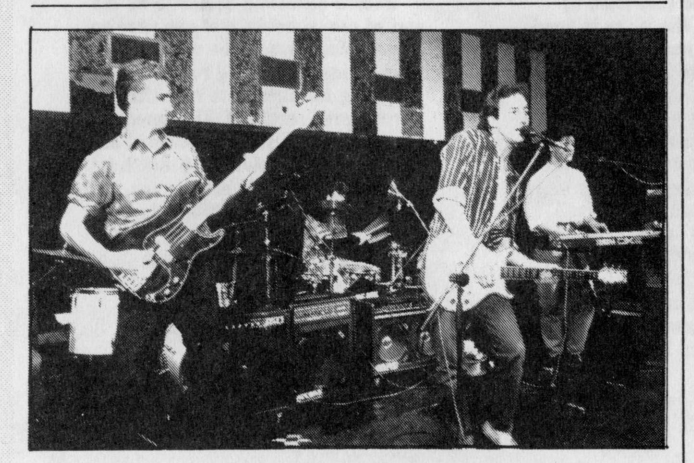
Duo playing at the Jazz Club New Year's Hop on Wednesday. The Hop featured 4 College bands and was attended by about one hundred people.