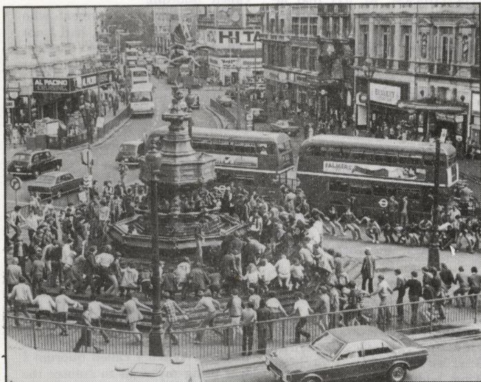
Ring-a-Ring-a-Roses at Eros