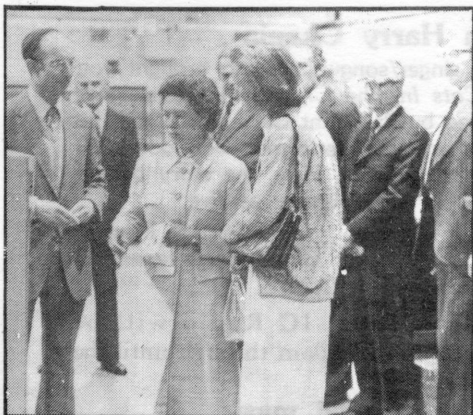
The Princess is shown metal cutting by laser

HRH Princess Margaret departed from the Main Entrance of the Royal School of Mines at 4:00pm.