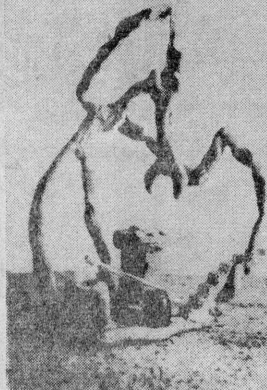
"B.Sc. Failed (Chem. Eng.)," a sculpture in the exhibition.