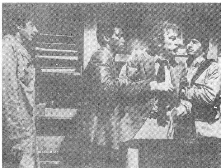
Matthew Bennell (Donald Sutherland) captured by aliens

are not portrayed as "zombies" but as a different kind of man, perhaps superior due to a lack of emotion. Our hero cannot appreciate this and is determined