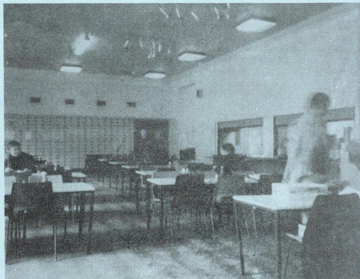
The Union Lower Refectory at 1.15 pm during yesterday's boycott

The one-day boycott has been a great success, exceeding all but the most optimistic predictions and there now is every indication that next term's continuous boycott will be successful.