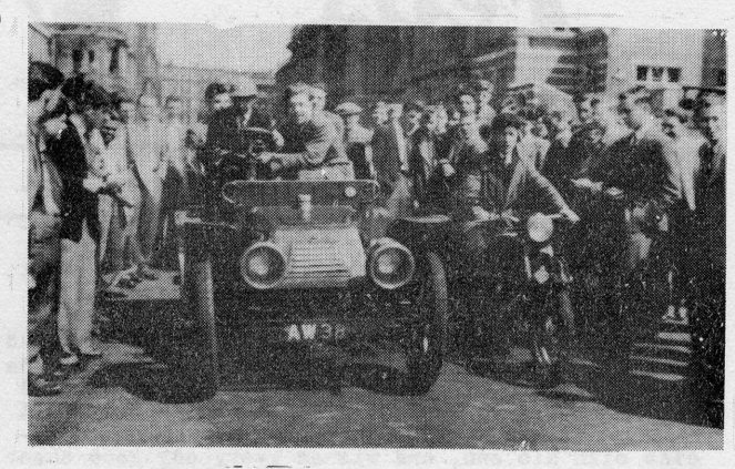
THE START OF THE TEST