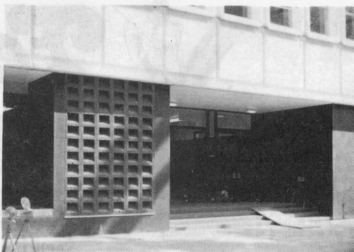
Front of W2

W2 has taken two and a half years to build and by the time all costs are totted-up, will have cost in excess of £3 million.