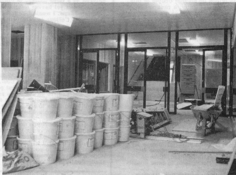
inside foyer of new Huxley