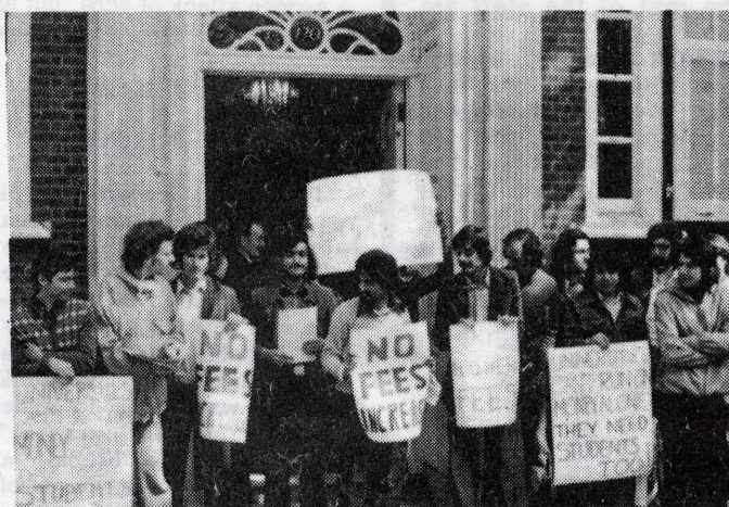
The picket line outside the Rector's residence.