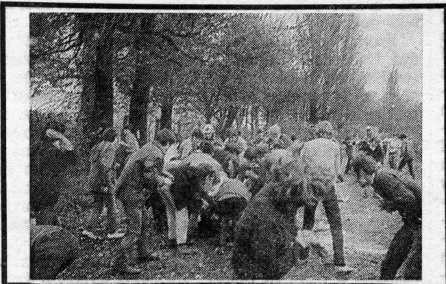
Somebody's dropped a sixpence