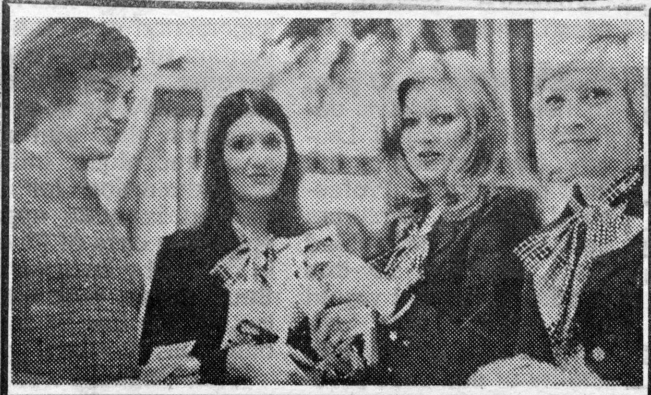
Who'll carry the can