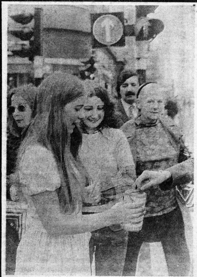
Couldn't you just give her something

Entry Forms to be handed to I.F., R.C.S., C.&G., or R.S.M. Unions by Thursday, 22nd November.