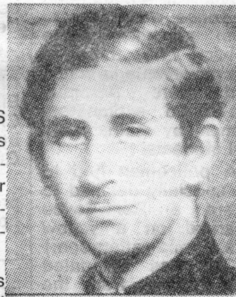
Prince of Wales.

I see that your "christian" mouthings are only skin deep for you are prepared to offer distribution to a newspaper whose attitude towards the quarter or so foreign students in this college is anything but the courtesy and friendliness to which they are at present accustomed at I.C.