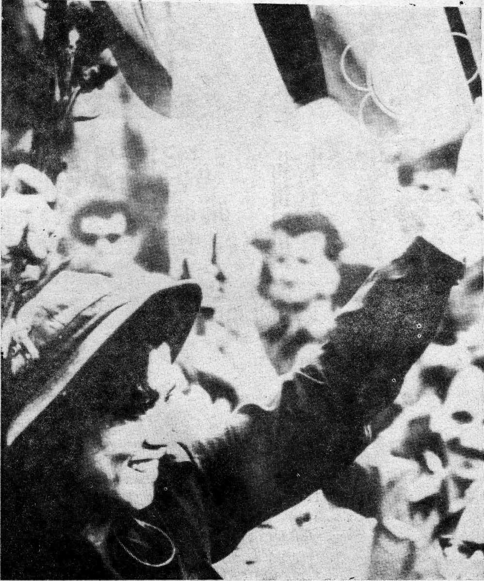
JUBILANT GIRL CALLS FOR DEFEAT OF IMPERIALISTS

The other reason is that the incident is also used by other groups to attack the festival as a whole, and thereby divert the attention away from the anti-imperialist aspect of the festival. The article which appeared in Felix last week was such an example of that tactic. Articles attacking the festival have, not surprisingly, come from the Express, the Daily Telegraph and other Fleet Street papers whose relations to Big Business are too well known. But I must admit that I hadn't expected Felix to join ranks with these papers. I know that the editor likes to call himself a young socialist, but his consistent attack on the anti-imperialist movement makes me doubt what his true colours are. RENATO EZBAN