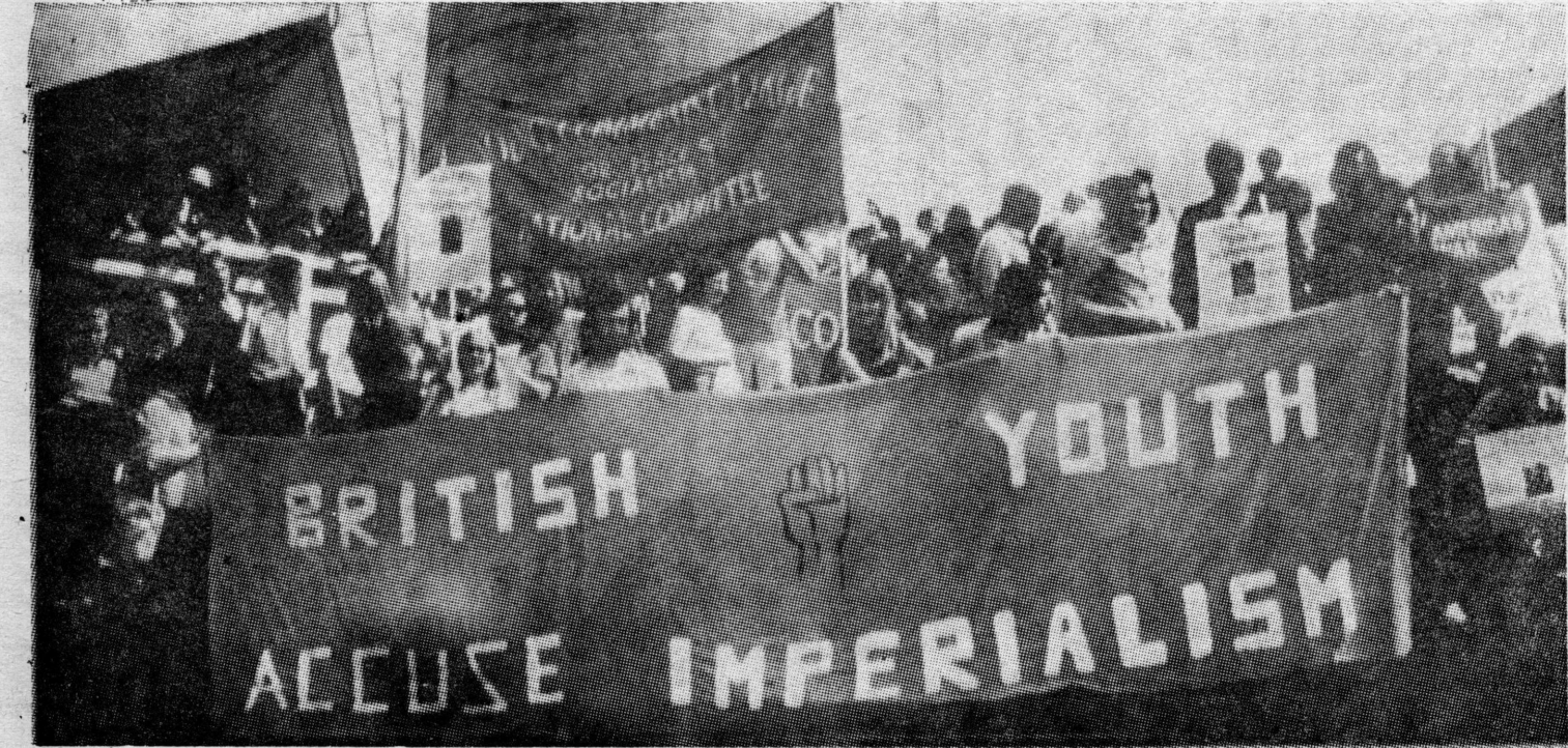
BRITISH DELEGATION IN EAST BERLIN

There were no attempts by the GDR to prevent contact between young Germans and the foreign participants; in fact, quite the contrary.