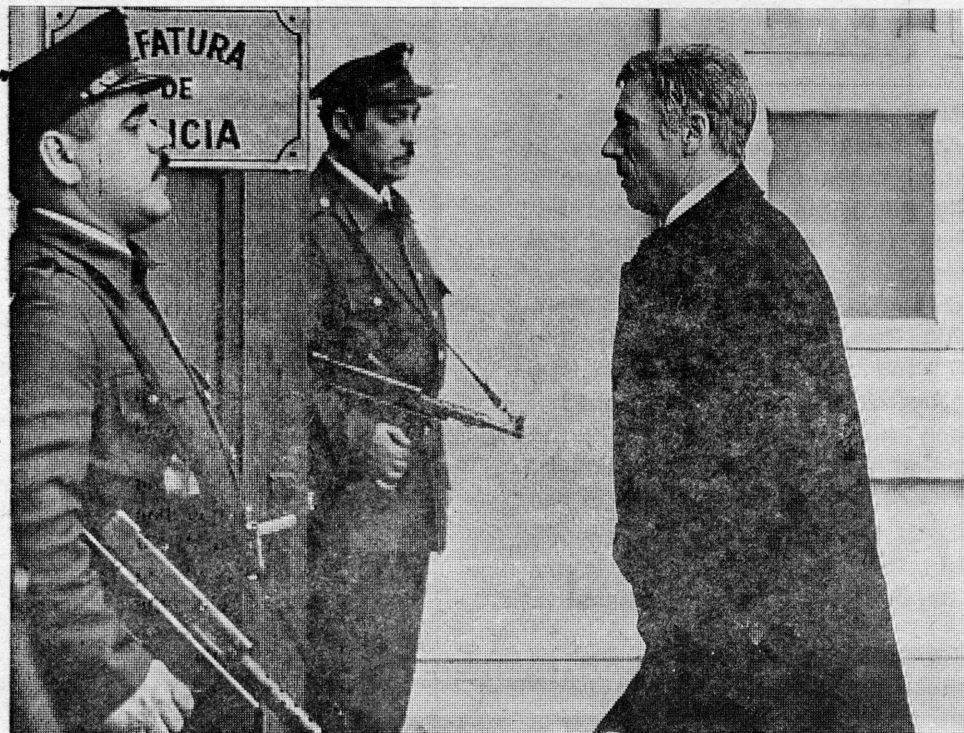
Yves Montand arrives at Police headquarters in 'State of Siege'