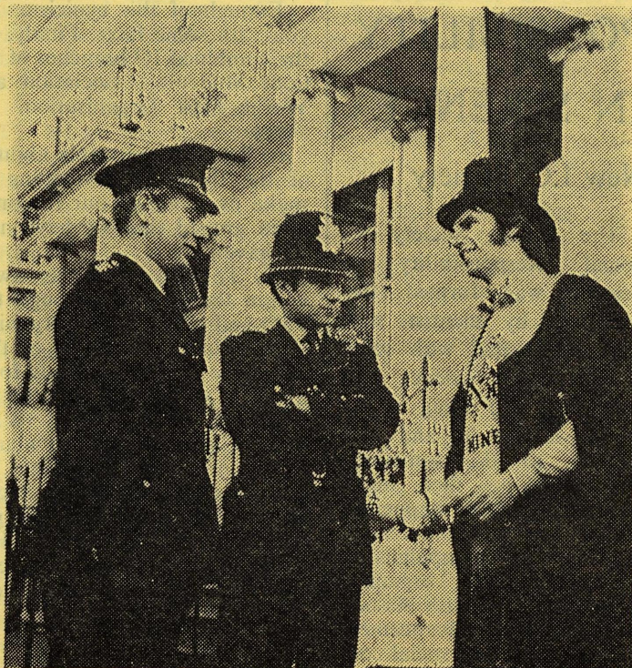
ABOVE: The recent reception of the Japanese Emperor at South Kensington Tube Station.

part was actually won by the only other entrant—a 13-year-old boy!! Luckily they, together with the other fifty or so College supporters, had more joy when it came to collecting for the rag fund. Here, though, they were in competition with collectors for the Mayor of Kensington's Play Association appeal, who collected £50, for which amount a cheque was presented to the Mayor after the races.