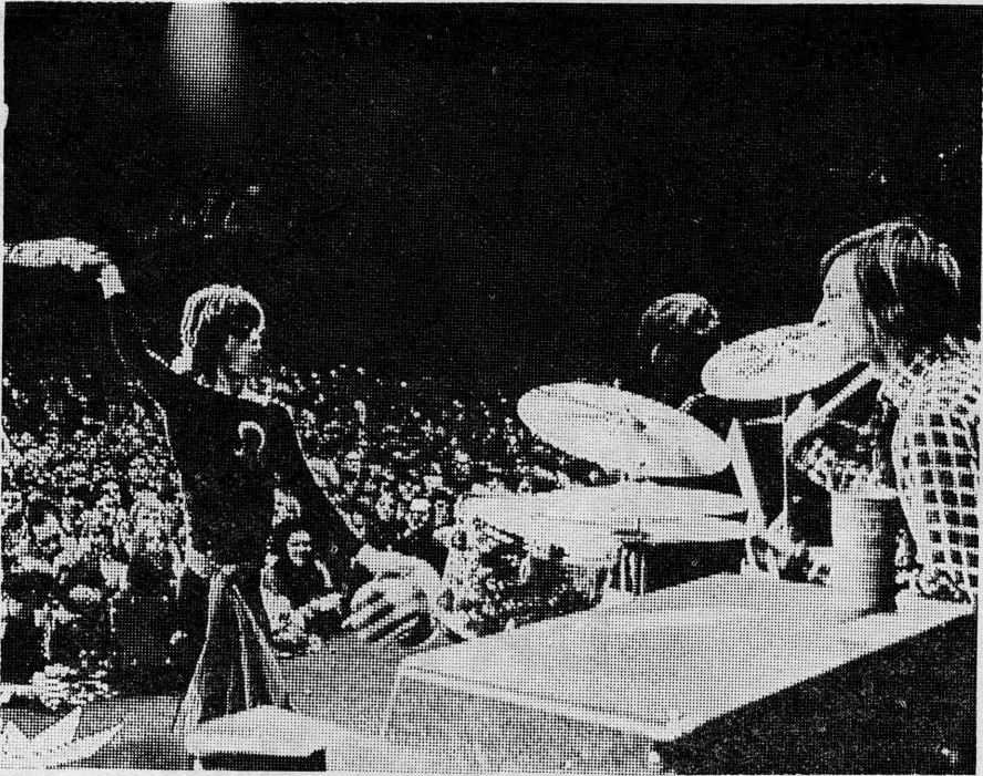
Terry Riley: "A Rainbow in Curved Air"