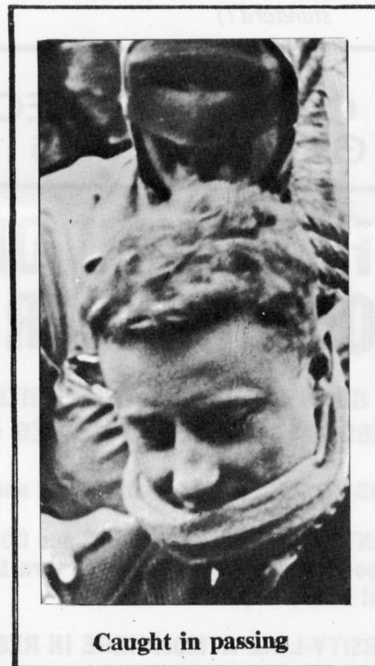
Caught in passing

In previous years Beit hall supported those students who saw it fit to run the Union. They eked out their elaborate lives by a series of intrigues which still sprout like weeds along those hallowed Halls. The introduction of Week's hall like an invisible finger in a grey dawn foretold of a rosy dawn if not a golden future for residents of this college.