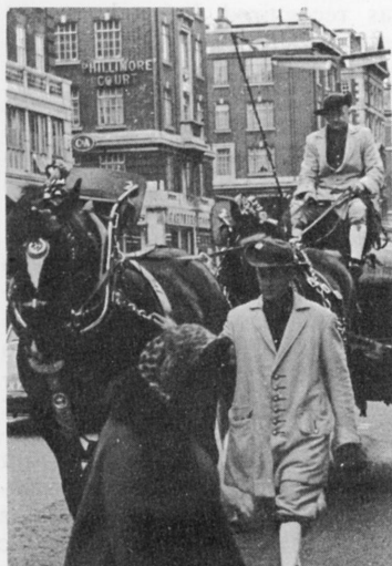
Brewer's Dray at head of Carnival Procession last Saturday