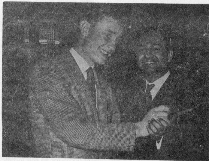
PRESIDENTS—Past and Future.