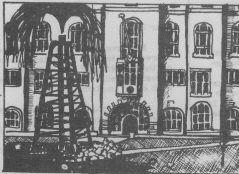
LAST NIGHT'S EXCLUSIVE PICTURE OF THE IMPERIAL COLLEGE GUSHER