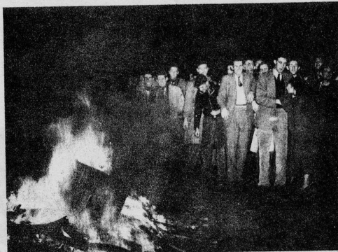
NOVEMBER THE FIFTH