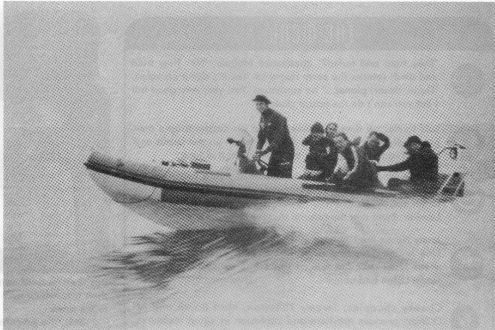
Lift-off: Underwater Club's boat takes to the air shortly before the divers go under