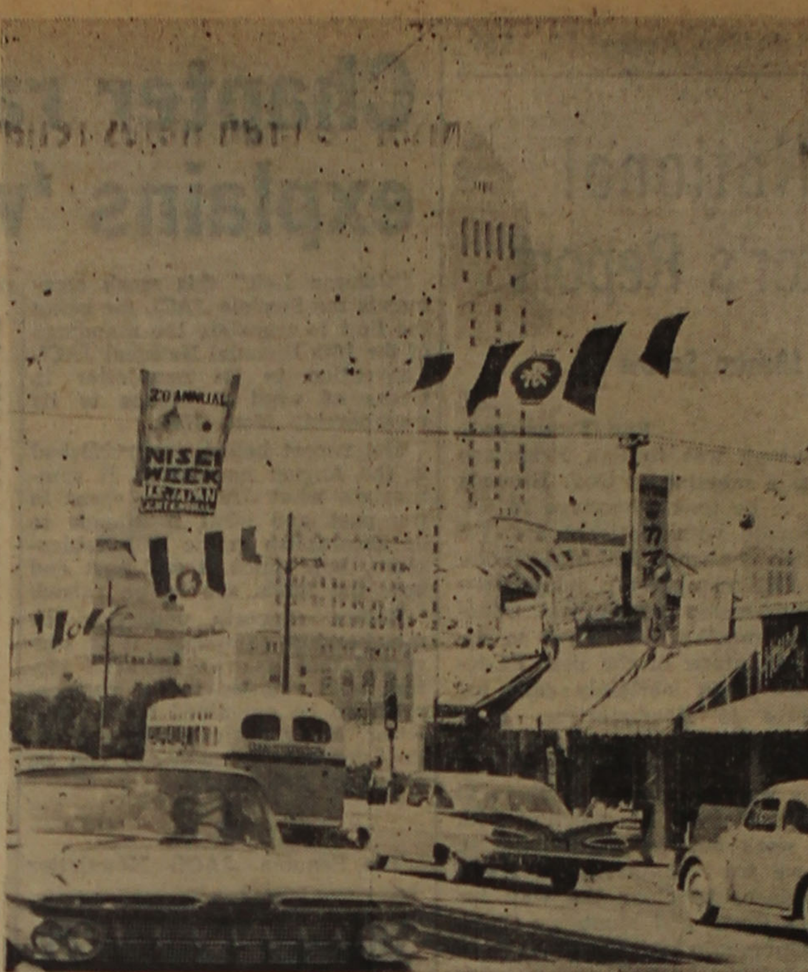
Looking west from First and San Pedro, Li'l Tokio streets are decorated with banners and lanterns for Nisei Week Festival, coming to its climax this Sunday with an gigantic Ondo parade with 1,000 dancers.