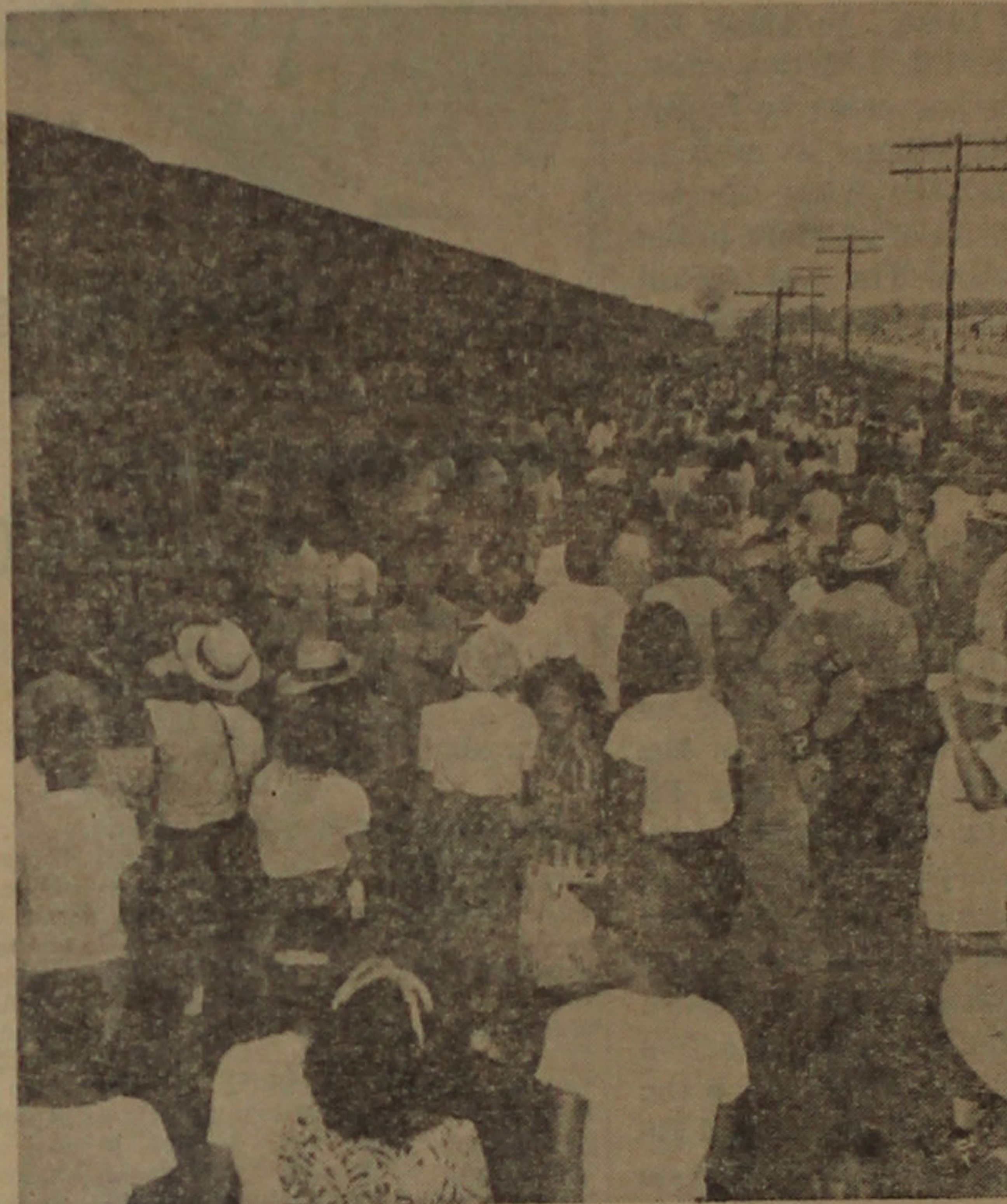
Moving evacuees from Jerome in June, 1944, before the camp closed, friends were allowed to pass beyond the the camp fences to say goodbye.