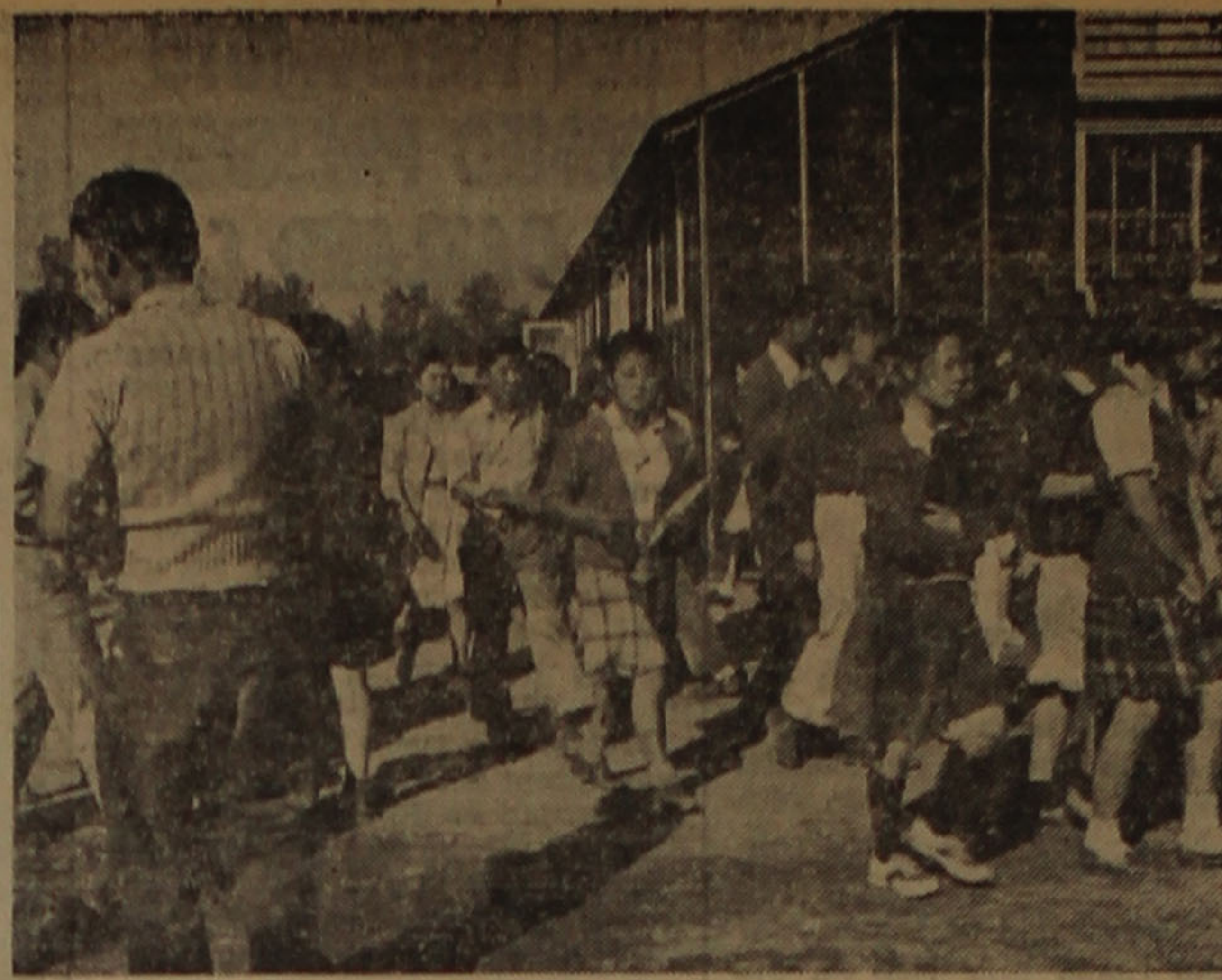
Changing classes at the temporary high school quarters at Rowher Relocation Center

We will also forget that the Issei were saying the same thing about us back in the 'Thirties. And somehow, we seem to have made out okay, made out well enough to look to the 'Sixties with zestful anticipation.