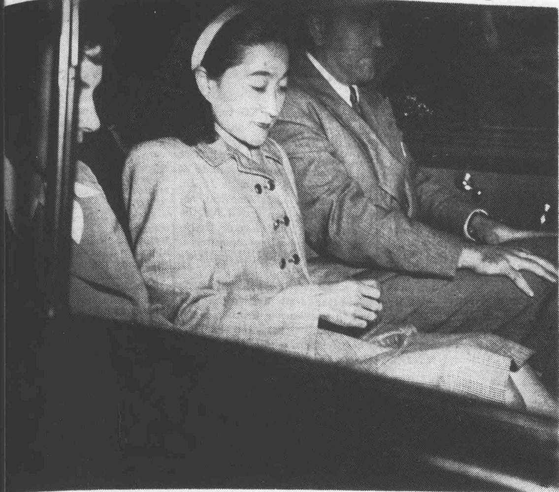
Mrs. Iva Toguri d'Aquino, popularly identified as "Tokyo Rose," is shown being whisked away from the Army Transport General Hodges shortly after her arrival in San Francisco on Sept. 25.

She faces treason charges for wartime propaganda broadcasts over Radio Tokyo.