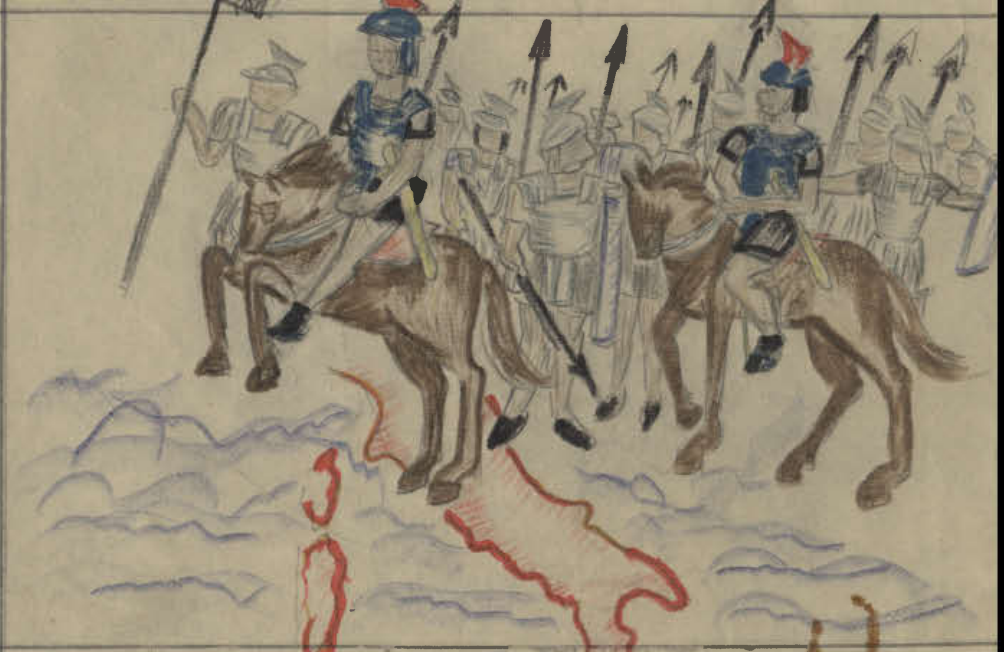
Undying devotion to Rome.