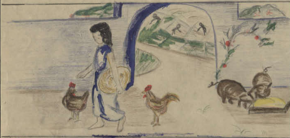
(1) No Extremes of rich and poor.