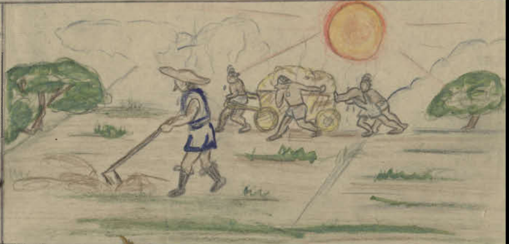
Simple life and no fear of hard work.