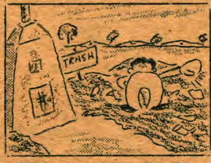
of the main track, for fire-

Concluding the event will be an exhibition dog fight.