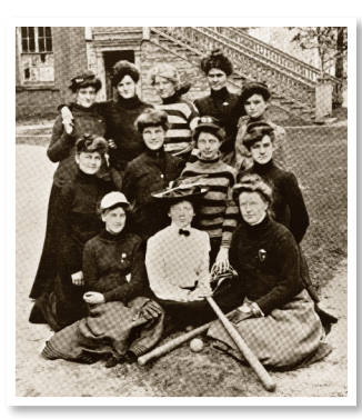
The Wesleyan College baseball team in 1902 with Adelpheans and Philomatheans