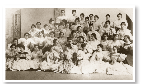
The Adelphean Society in 1895