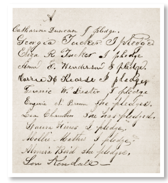
Adelphean pledge signatures from 1852