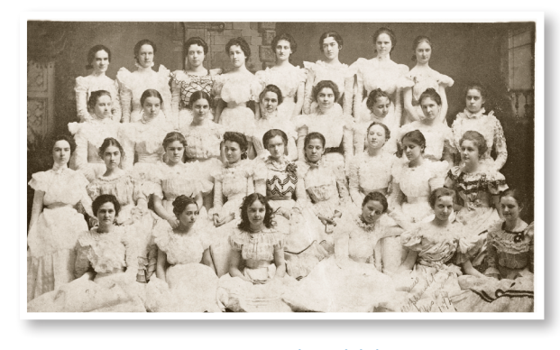
The Adelphean Society in 1898