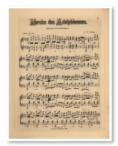
"Marche des Adelphiennes" composed for The Adelphean Society in 1883 by J.T. Coley