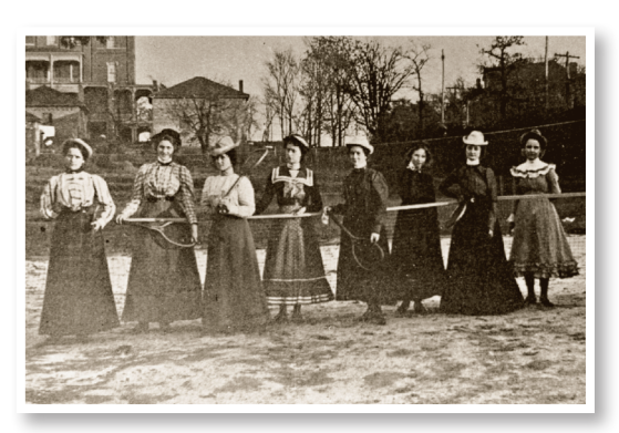
Adelpheans playing tennis c. 1900